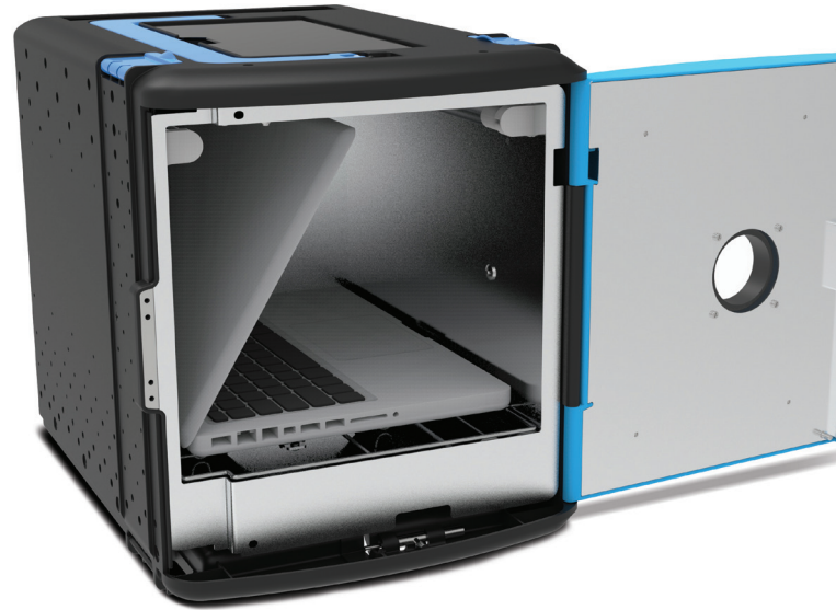
Can hold open laptops to disinfect the most germly surfaces: the keyboard and screen