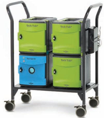
Tech Tub 2 ® Modular Cart with UV Tub Charges 18 devices

**Phillips brand bulbs are easily replaced and available from Copernicus. Bulb hours may vary based on frequency of use.