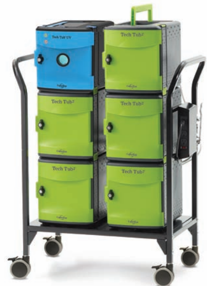
Tech Tub 2 ® Modular Cart with UV Tub Charges 26 devices