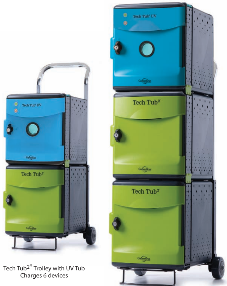
Tech Tub 2 ® Trolley with UV Tub Charges 6 devices

**Phillips brand bulbs are easily replaced and available from Copernicus. Bulb hours may vary based on frequency of use.