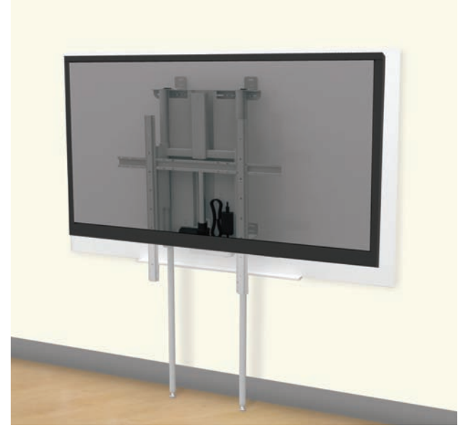
Floor support kit for mounting to studded walls