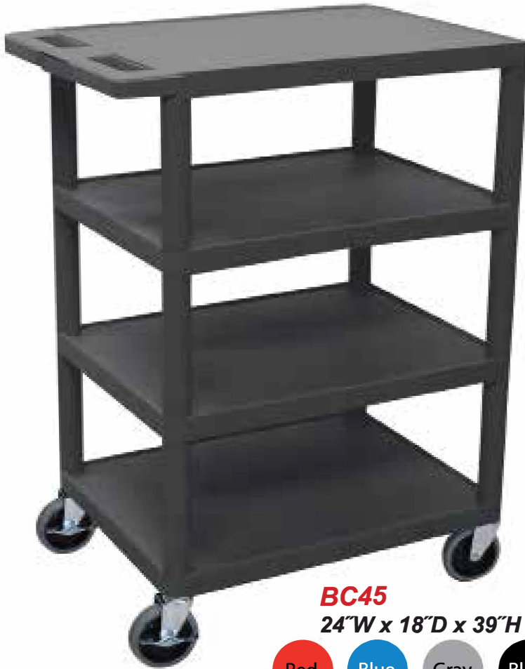
BC45 24"W x 18"D x 39"H